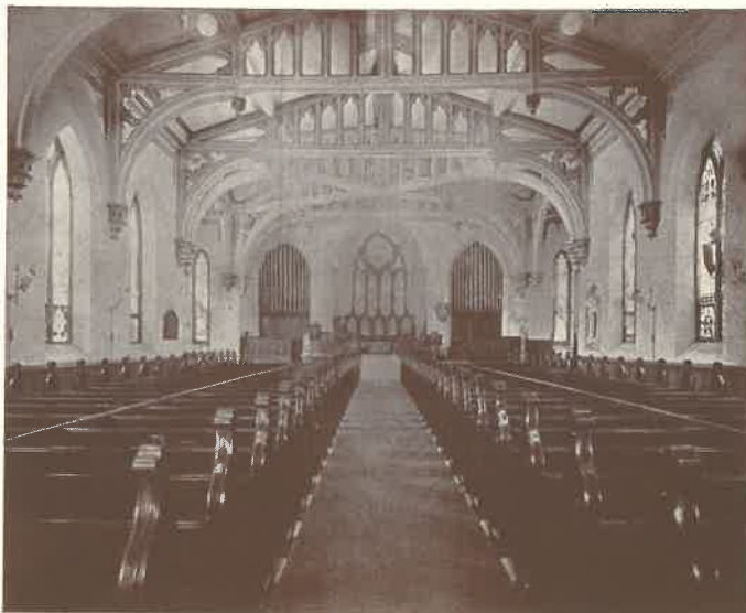
INTERIOR OF CHRIST CHURCH